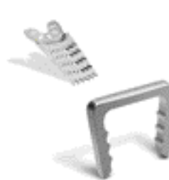
Nitinex™ Memory Compression Implant and One Cut Blade