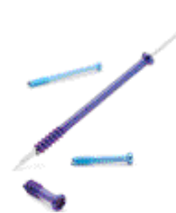
Titanex™ Small Cannulated Screw System